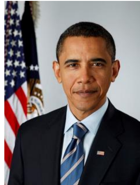
Official presidential photos are in the public domain.