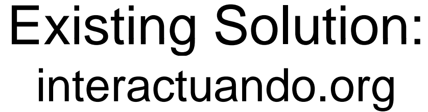
Image removed due to copyright restrictions. Screenshot of http://www.interactuando.org .