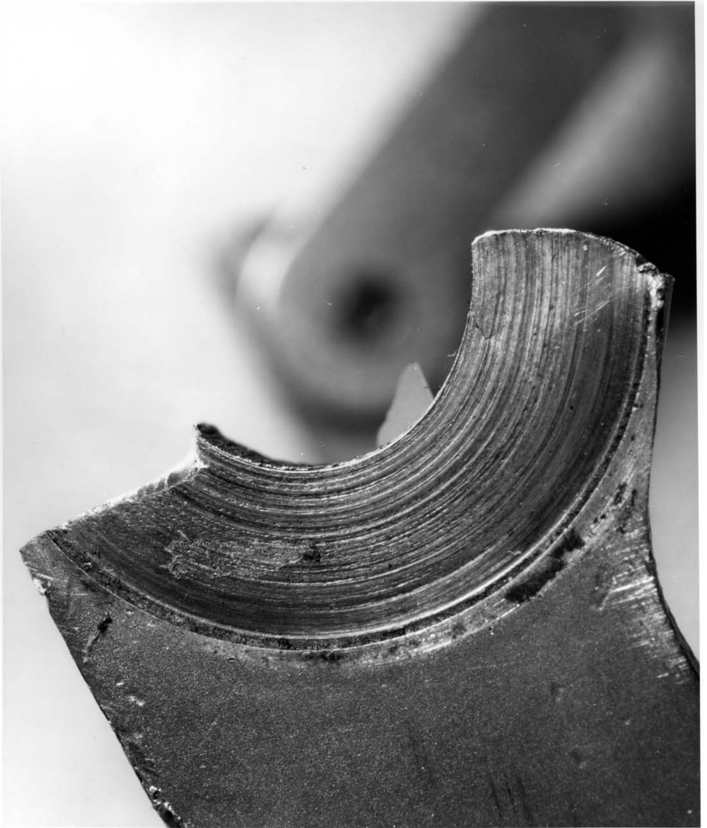
Figure 2: Close-up of side of brace in region of fracture.