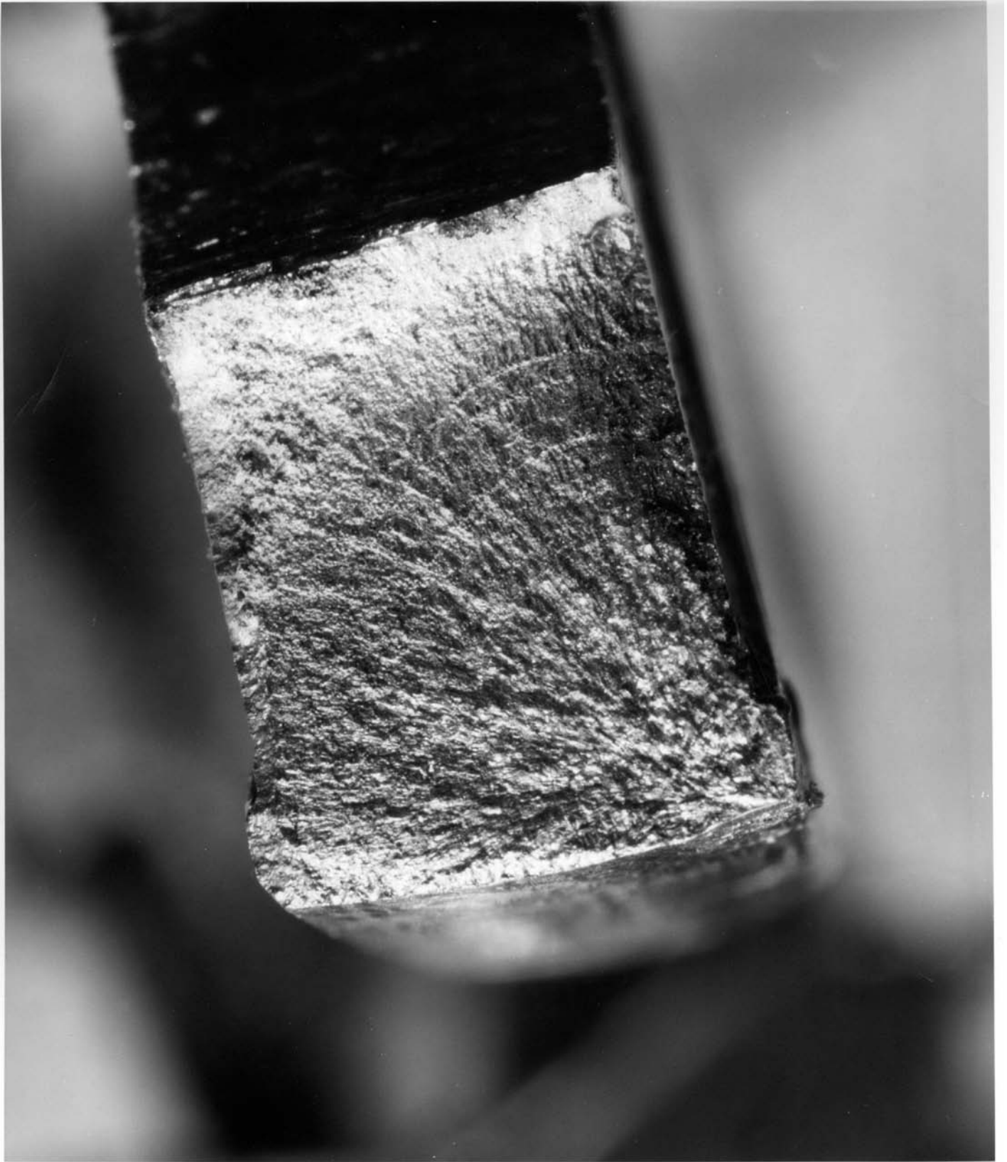
Figure 4: Close-up of fracture.