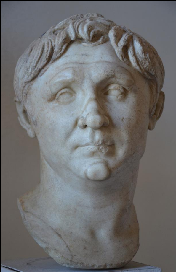
This image is in the public domain. Source: Wikimedia Commons .